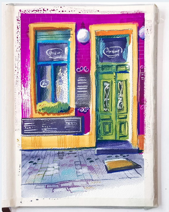
Step 7. Add more details if you feel like it.