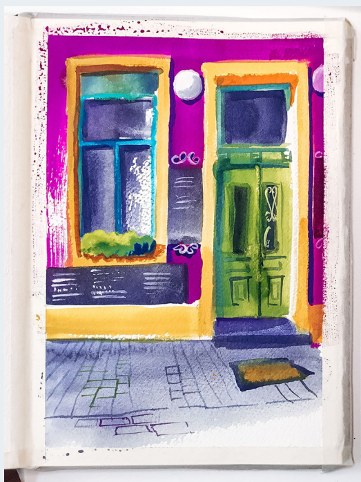
Step 5. Add details with colored pencils.