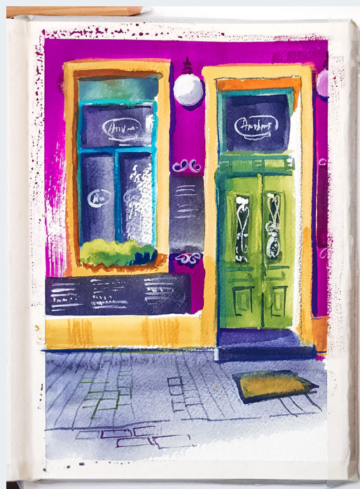
Step 6. Add more details with colored pencils and gouache again.